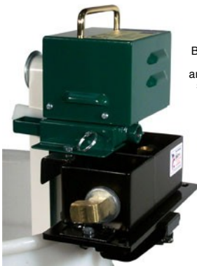
Belt Skimmer, Diverter™ and Lockjaw™ shown here